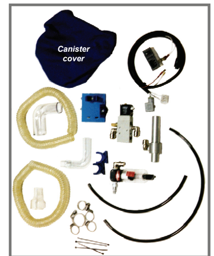
Not available on all models