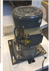
1HP Electric Motor