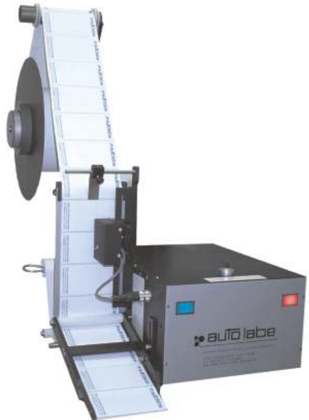
MODEL 110 Right Hand Automatic Label Applicator