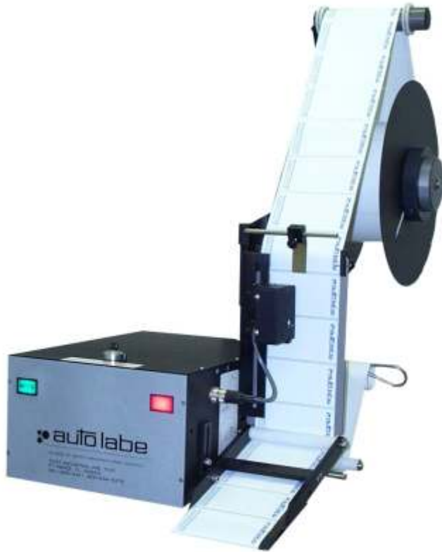
MODEL 110 Left Hand Automatic Label Applicator