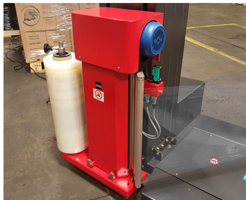
Film Carriage Assembly