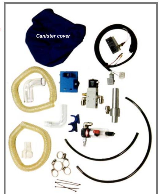
VTR parts kit (includes canister)

for more information call: Miller/Bevco 800-821-2177 Sales@MillerBevco.com www.MillerBevco.com