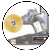
Top cartridge tips back on head for tape threading.