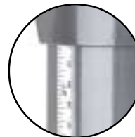
Leg extensions are clearly marked with graduated scales in both inches and metric dimensions. Leg adjustments slide and lock in place to accommodate conveyor heights from 22.25" to 32.25" (565 mm to 819 mm).