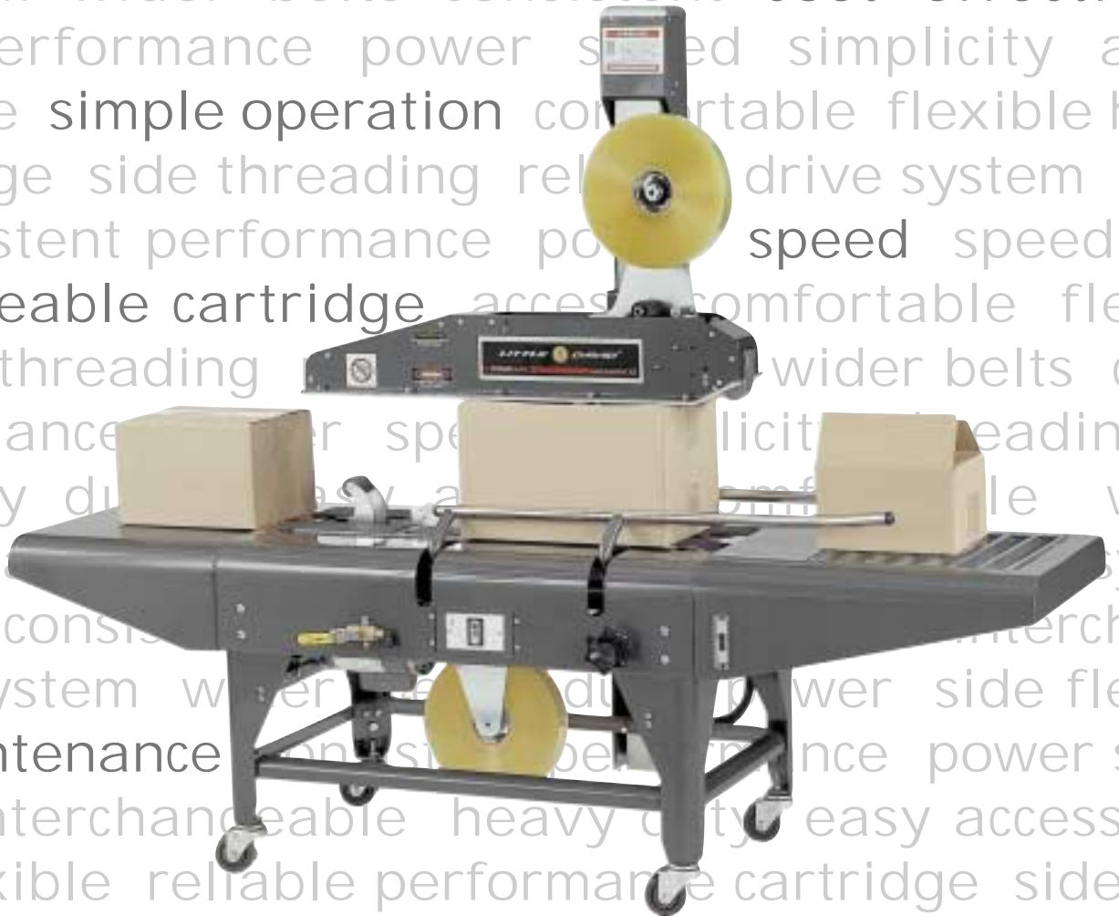
Photo shows optional exit pack table and optional casters.